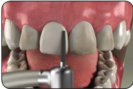
Preparing the teeth

Veneers can give you straighter, whiter, and more even-looking teeth. The porcelain has a translucent quality that resembles your natural teeth.