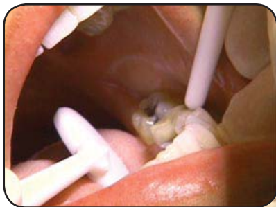
Tapping the tooth

You may also be unaware of the problem because there are no symptoms at all.