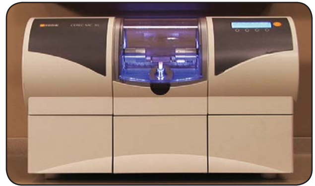
CAD/CAM milling machine